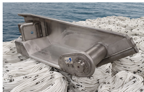
VIEW FROM OPERATORS POSITION