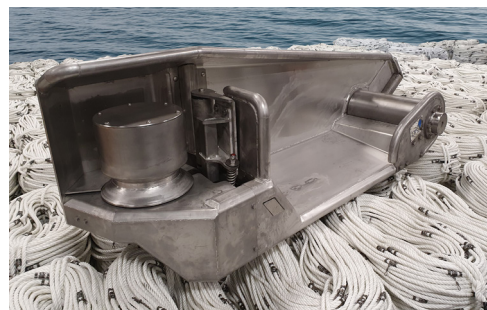
VIEW FROM INSIDE